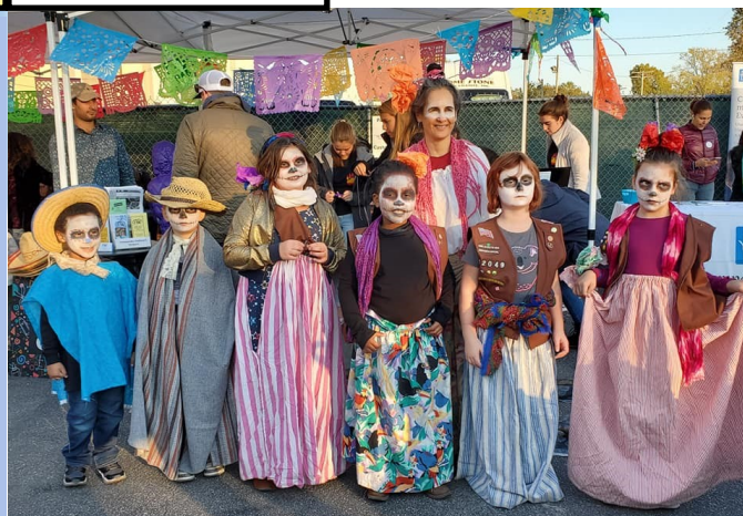
Below: Brownies (and brothers) took part in the Day of the Dead Festival and parade.

helps us to reduce and waive fees as needed. Look for new projects in 2020, supported by grants from BGE, Four Rivers, and the Maryland Heritage Areas Authority!